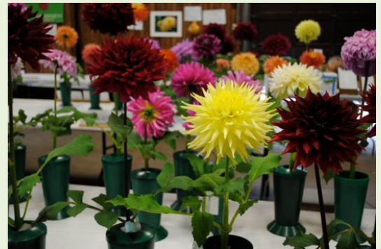
From the garden, left, to the show table above. What a great way to share what you have grown and enjoy the beauty of dahlias.