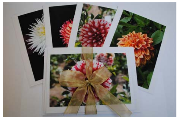
LIDS Note Card Set